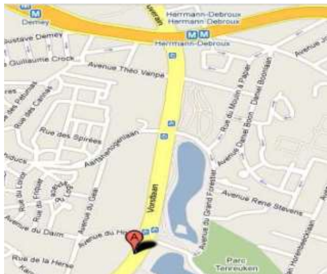
ERMCO Office – Boulevard du Souverain 68